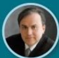
Yefim Bronfman Tuesday Recital