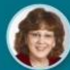
Melody Bober Elementary Piano