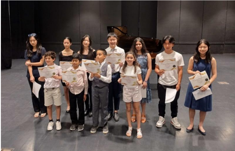
Spring Adjudicated Performances, Falbo Theatre, May 4, 2024