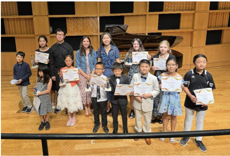
Spring Adjudicated Performances, Bloch Hall, May 4, 2024