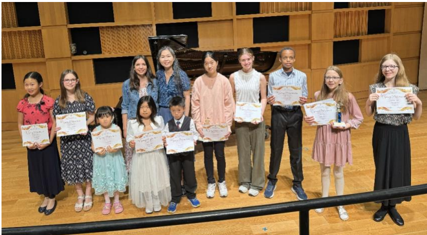
Spring Adjudicated Performances, Bloch Hall, May 4, 2024