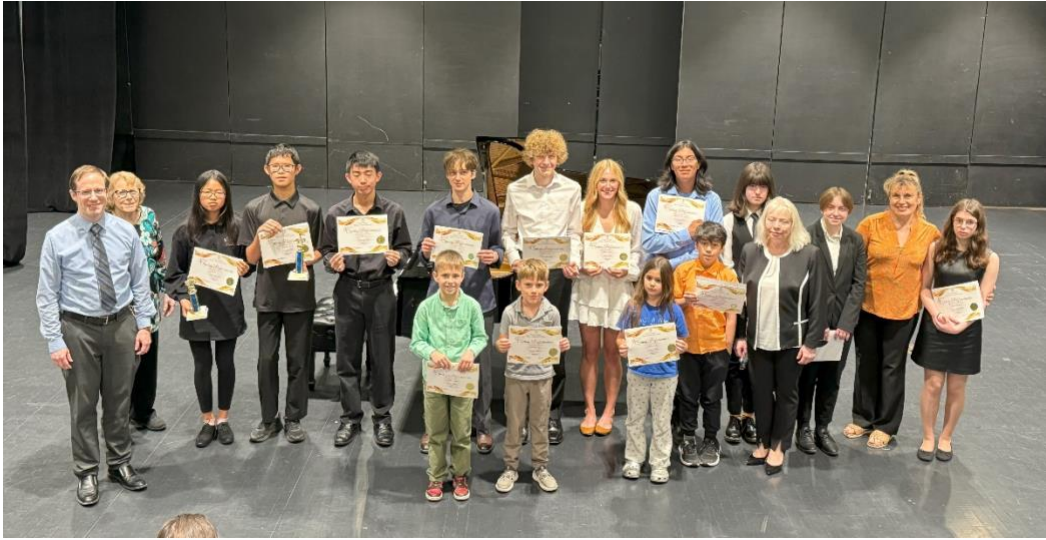
Spring Adjudicated Performances, Falbo Theatre, May 4, 2024