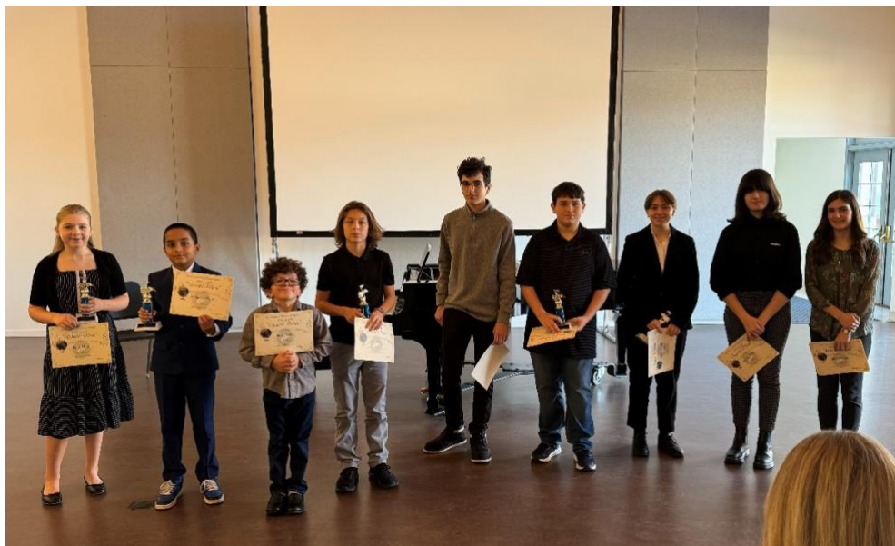
Fall Festival, November 11, 2023