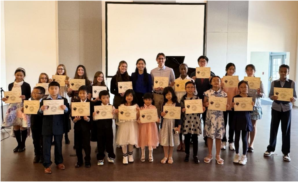
Fall Festival, November 11, 2023