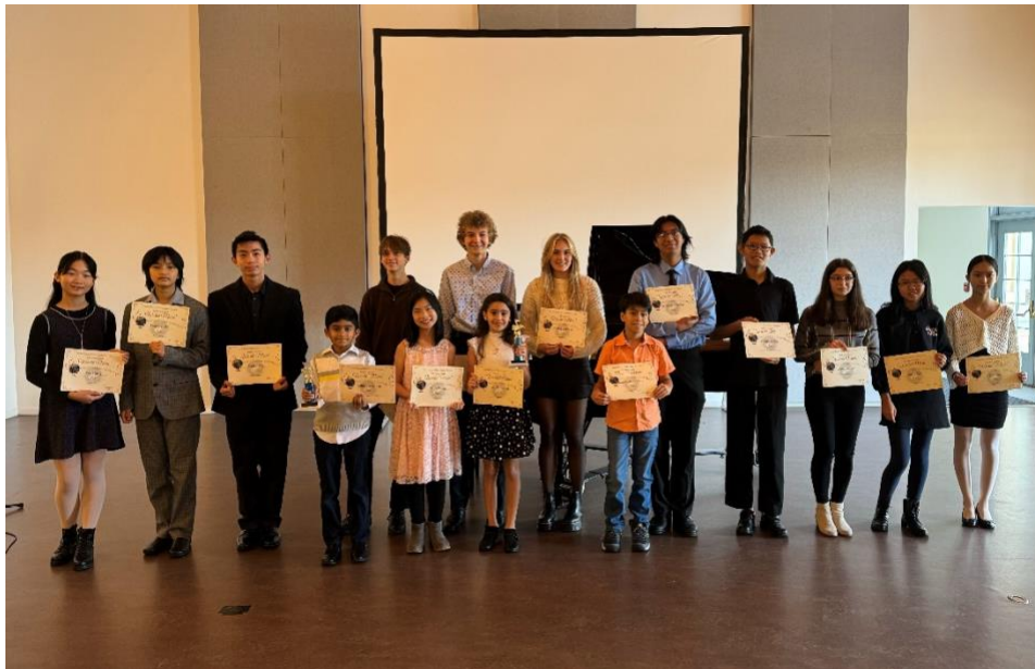
Fall Festival, November 11, 2023