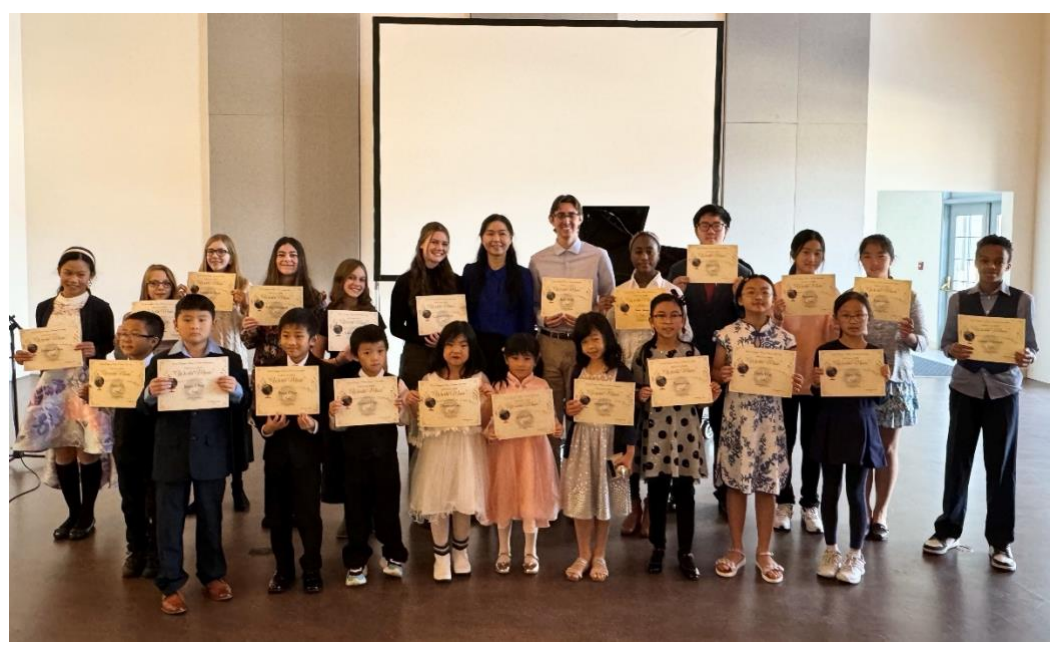
Fall Festival, November 11, 2023