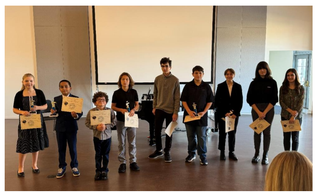
Fall Festival, November 11, 2023