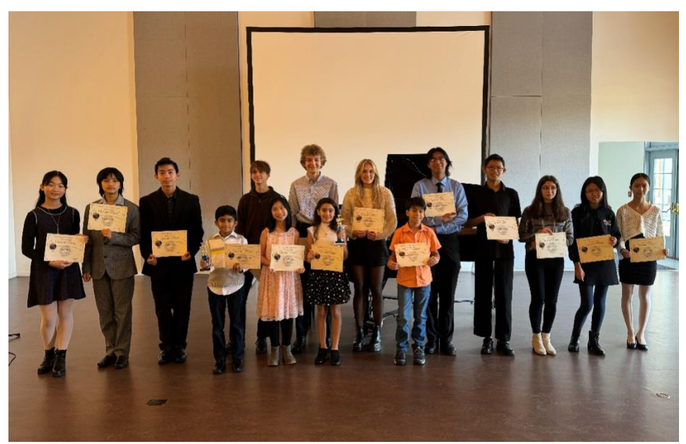
Fall Festival, November 11, 2023