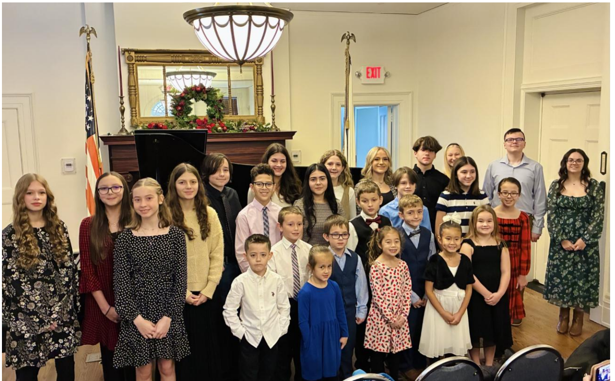
District 2 Fall Festival